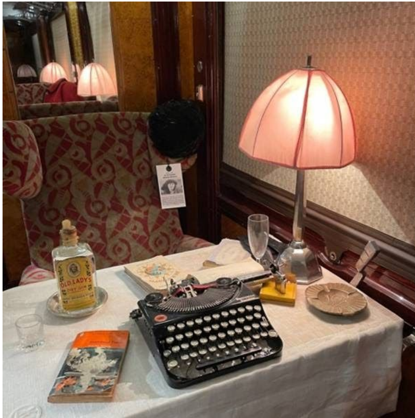
Inside the Pullman carriage of the Orient Express, there's a replica of what would have been Graham Greene's typewriter.

The Orient Express was known for its lavish decorations, and visitors will get to see the mastery of craftsmanship up close – from the Cordoba embossed leather ceilings and Lalique crystal bas-reliefs Gobelins tapestries to the velvet curtains from Genoa, silverware, precious tablecloths and crystal fine glasses – as you learn about its most famous passengers from Agatha Christie to Graham Greene and Josephine Baker.