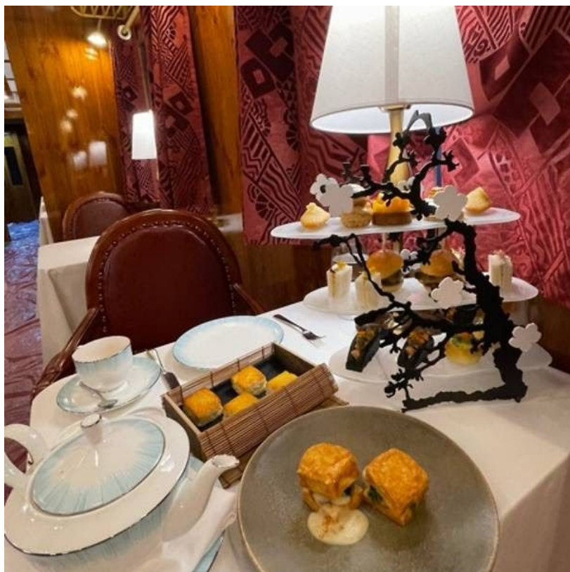
High tea on the Orient Express

There is also a lush pop-up restaurant featuring lavish cuisine from three-Michelin-starred Chef Yannick Alleno on board a replica Anatolia dining car that is on track to officially open for the full dining experience of lunch, brunch and dinner right before Christmas.