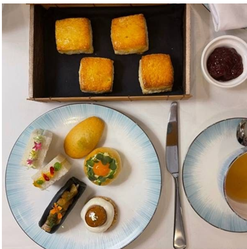
High Tea on the Orient Express

In the meantime, the restaurant will first open with high tea sessions (S$78 ++ per person), offering up delicately delicious Parisian pastries that include the likes of The True Saint-Honore, Caviar Lime Madeleine, Coffee Flavoured Religuses Pastry, Golden Profiteroles alongside crustless sandwiches of Comte Cheese and Savora Sauce as well as traditional English scones.