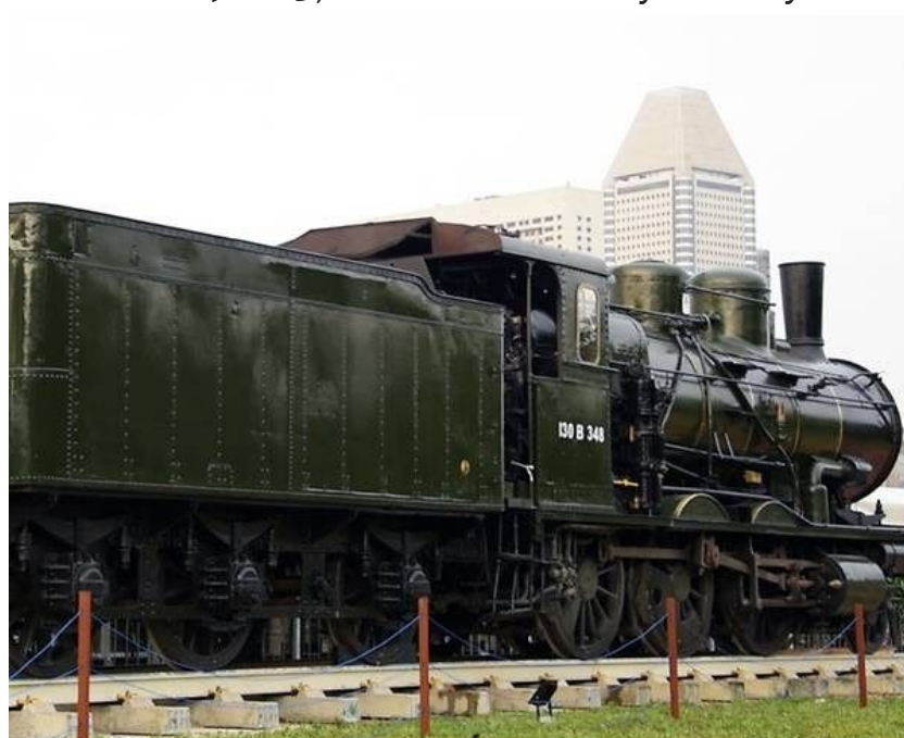
The exhibit Once Upon A Time On The Orient Express opens to the public on Dec 12

The event, titled Once Upon A Time On The Orient Express , will open to the public on Saturday (Dec 12) and run until Jun 13, 2021 at Gardens By The Bay's West Lawn.