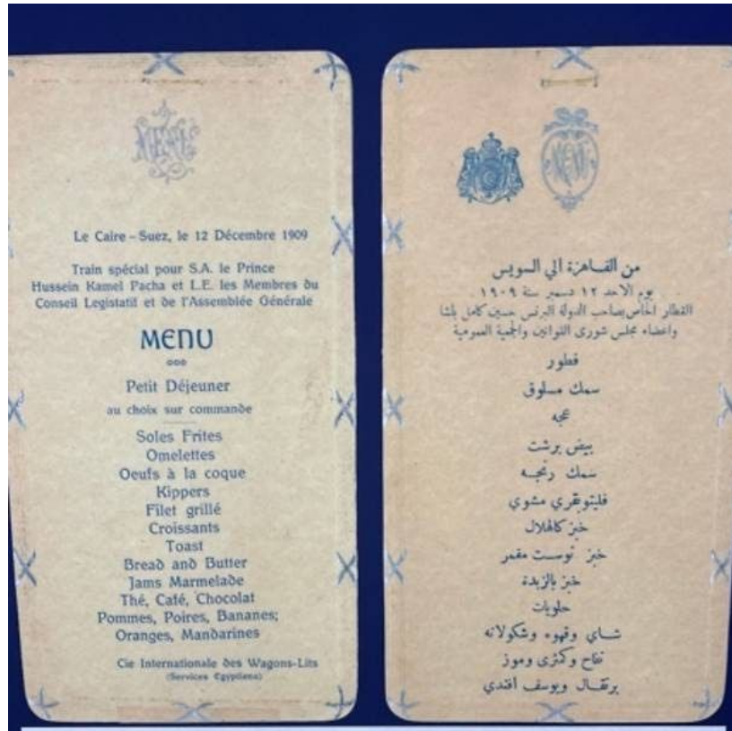
Original menus from the Orient Express

On top of an interactive segment via newsreels and film clips focusing on the history of the Orient Express and how it linked the famous route from Europe to our side of the world, there will be a fun escape room experience which is scheduled to open next year, where you get to play the famed Belgian detective Hercule Poirot and solve a mystery ala Christie's novel.