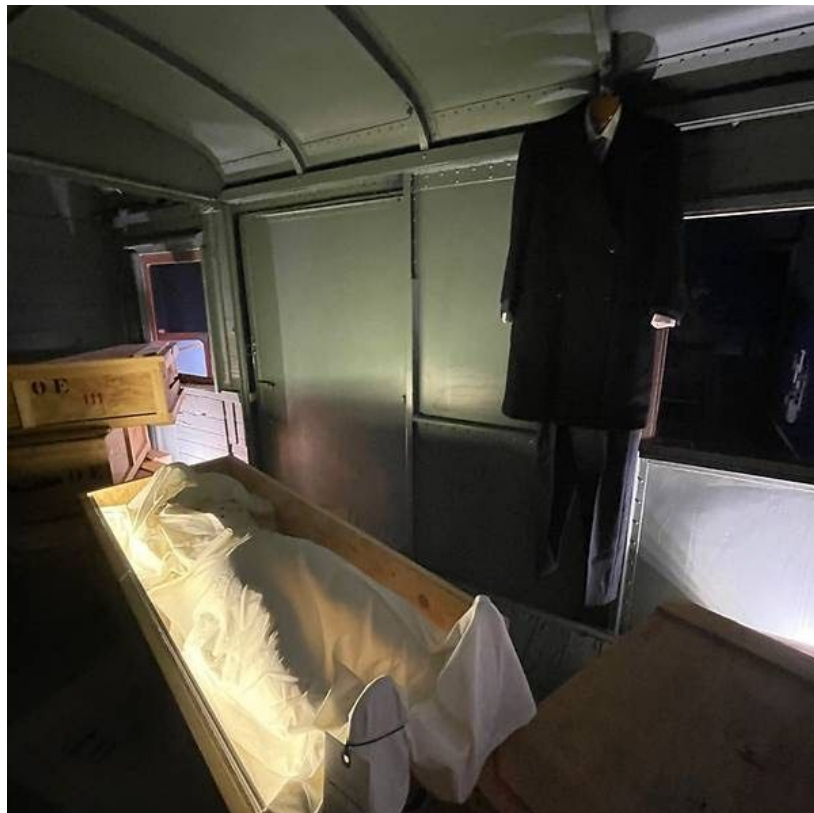
Fans of Agatha Christie's Murder On The Orient Express will love what's inside the fourgon carriage of the Orient Express.

On top of an interactive segment via newsreels and film clips focusing on the history of the Orient Express and how it linked the famous route from Europe to our side of the world, there will be a fun escape room experience which is scheduled to open next year, where you get to play the famed Belgian detective Hercule Poirot and solve a mystery ala Christie's novel.