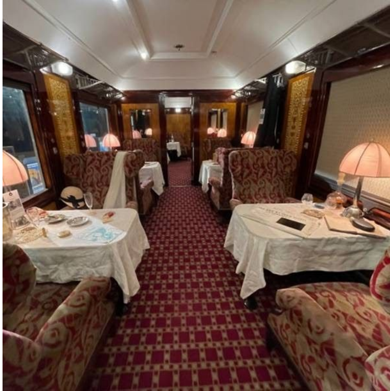
The exhibit Once Upon A Time On The Orient Express opens to the public on Dec 12

At the exhibition, visitors will get to see two of the original 1920s train carriages, as well as the original locomotive engine, which was built in France 158 years ago.