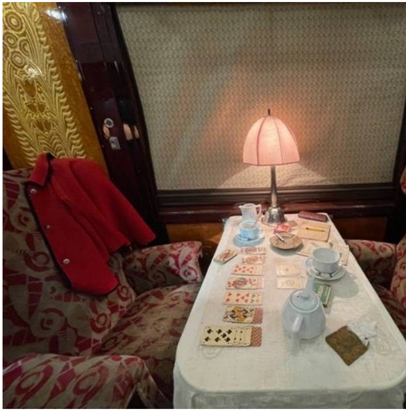
The exhibit Once Upon A Time On The Orient Express opens to the public on Dec 12.

Guillaume de Saint Lager, vice president and executive director of the Orient Express brand agreed: "It's an extraordinary opportunity to see this exhibition going on a world tour, with Singapore as the first stop. Gardens By The Bay is a magnificent showcase for the Orient Express, and echoes the exotic dimension of the brand. We hope, in these complicated times, to take Singaporeans on a journey into the myth of the Orient Express. A true escape for the senses."