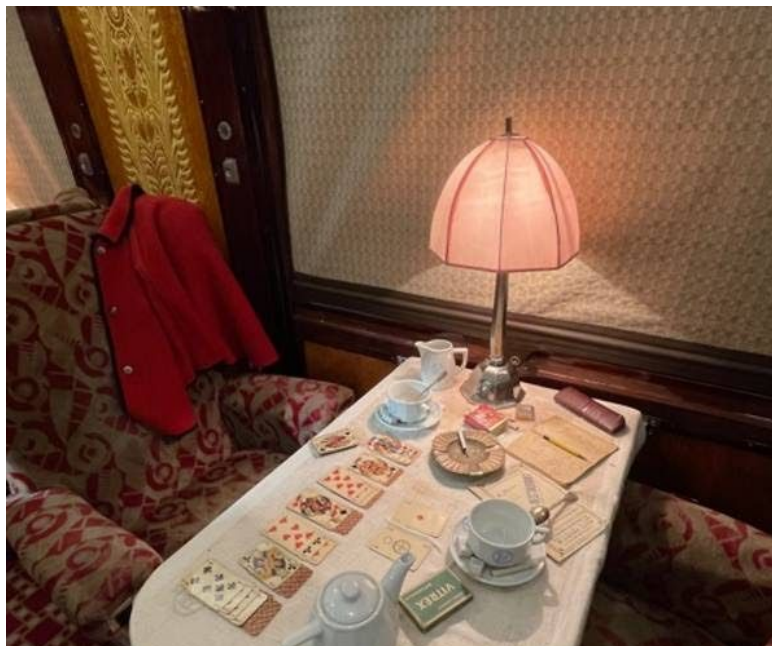
Inside the Pullman Carriage of the Orient Express. The exhibit Once Upon A Time On The Orient Express opens to the public on Dec 12.

The two carriages, which have been painstakingly restored to its former glory, include a fourgon car ( a wagon that used to carry luggage/cargo and one of only three left in the world today) and a Pullman car built in 1920 with interiors that boast a lemon burr marquetry inlaid with pewter floral motifs.