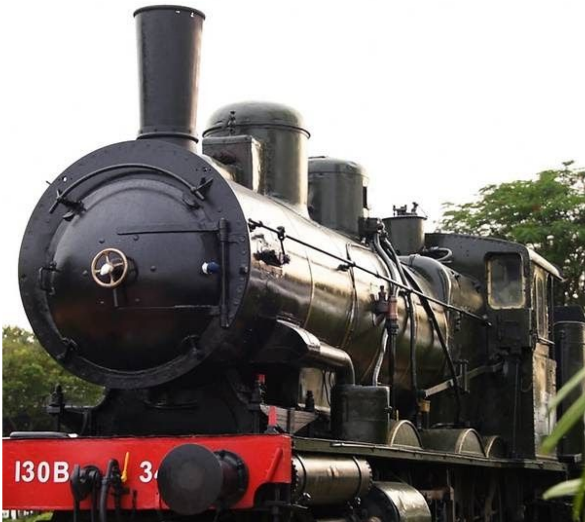
The original locomotive engine, which was built in France 158 years ago at the Once Upon A Time On The Orient Express pop-up exhibition in Singapore's Gardens By The Bay.

The Once Upon A Time On The Orient Express exhibit opens on Saturday (Dec 12). Visitors can walk inside pop culture's most famous train, with links to Agatha Christie, Dracula and James Bond.