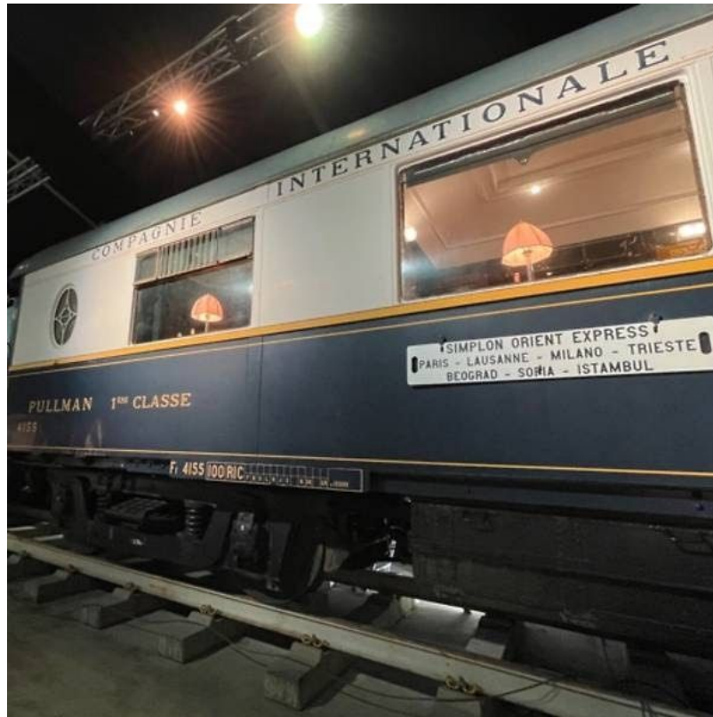
Orient Express' original Pullman carriage from the 1920s

And it's been a complicated set-up: On Nov 1, the train carriages and locomotive set sail from Paris (the first time it has ever left France) and it arrived in Singapore two days later on Nov 3, where it was carefully transported to the Gardens' West Lawn.